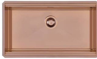
Sink Milanello Copper Workstation 1034 858