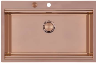
Sink Milanello Copper workstation 1034 058